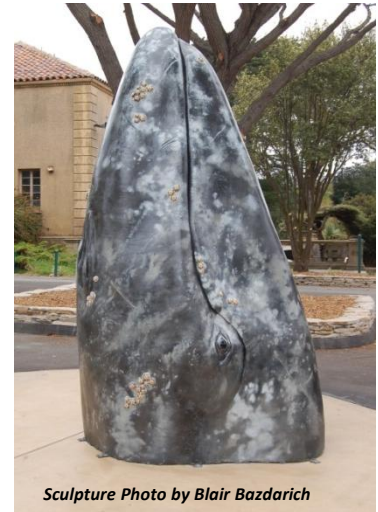
Sculpture Photo by Blair Bazzarich